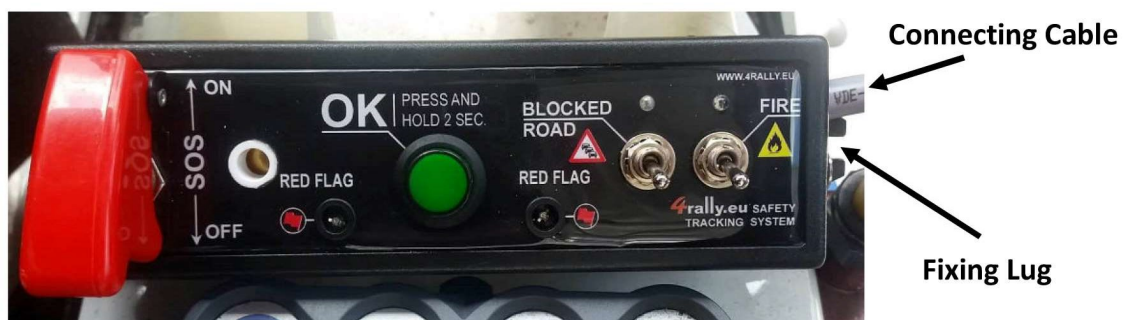
User Console – in reach of both crew members