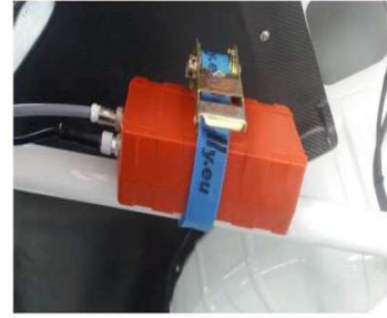
Receiver / Transmitter Unit

1) The main receiver / transmitter unit (an orange box) secured into position using the provided ratchet strap.