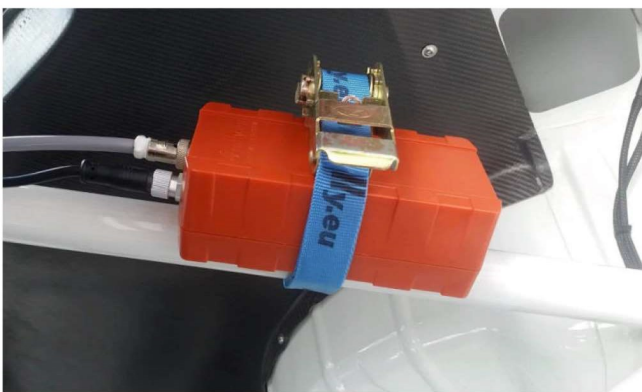
Receiver / Transmitter Unit

The receiver / transmitter unit is fixed to a bar of the roll cage in the rear of the car (using a small ratchet strap which is supplied) and the console is mounted in the centre front of the car such that both crew members can, both see and reach it, while belted in their seats . The connecting cable is then ran to the receiver / transmitter unit in the rear of the car, generally being cable tied ( cable ties not supplied ) to the bars of the roll cage. In routing the cable, care should be taken to ensure that the cable is fixed to the inside of the roll cage bars in order that it is not damaged in the event of an accident where the body panels are pushed against the roll cage.