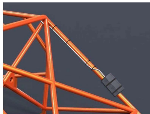
Connecting Cable – routed on inside of roll cage in order to avoid damage in event of car rolling etc.